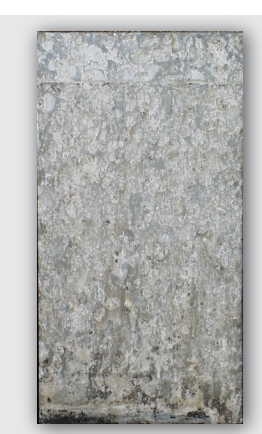
Conclusion: ACF-50 prevents the formation of new corrosion cells.

Untreated panels showed and average weight loss of 150.1 mg.