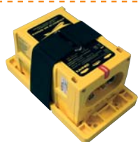
Universal Mounting Bracket